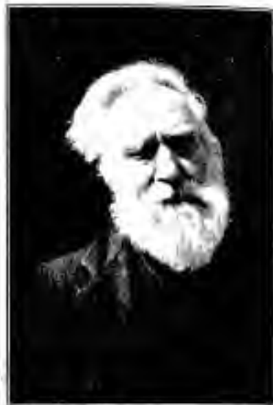
(b) Another Gloucestershire fiddler